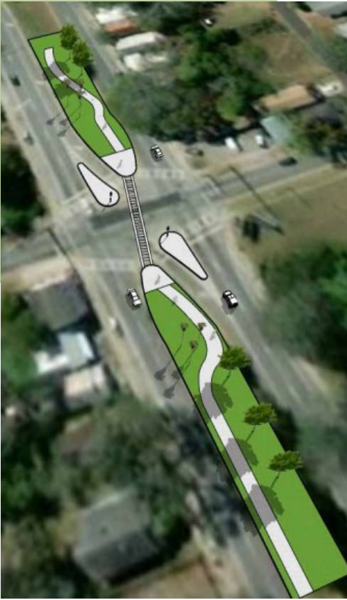
ILLUSTRATION FROM MLK/AA BIKE/PED CORRIDOR STUDY