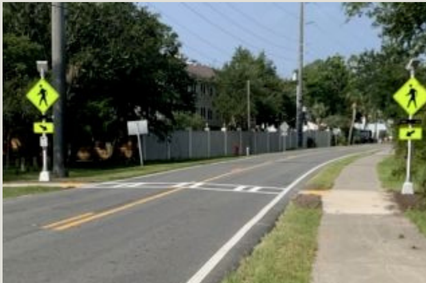
Pedestrian Beacon and Crossing at Massengale Park Entrance on Ocean Boulevard